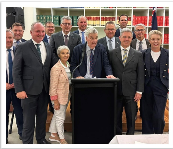
Former Leader of the National's in the Senate Ron Boswell's Biography Launch, March 2024