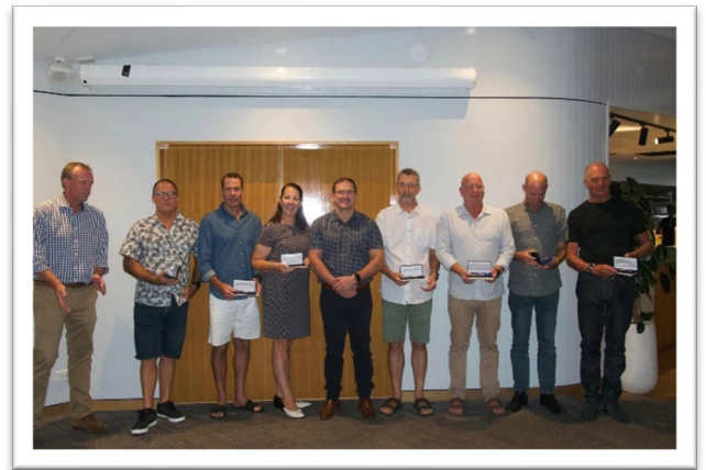
Sunshine Beach Surf Lifesaving Club March 2024