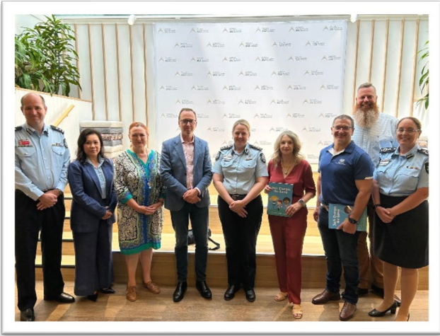
Joint Committee on Law Enforcement visit to the Australian Centre to Counter Child Exploitation in Brisbane, February 2024