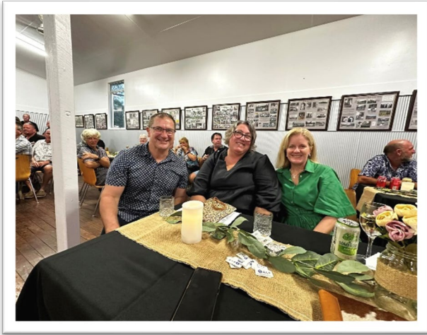
Gympie Music Muster Thank You Party February 2024