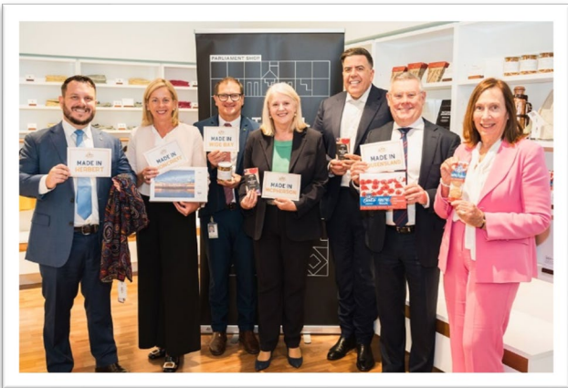
Parliament House National Showcase February 2024