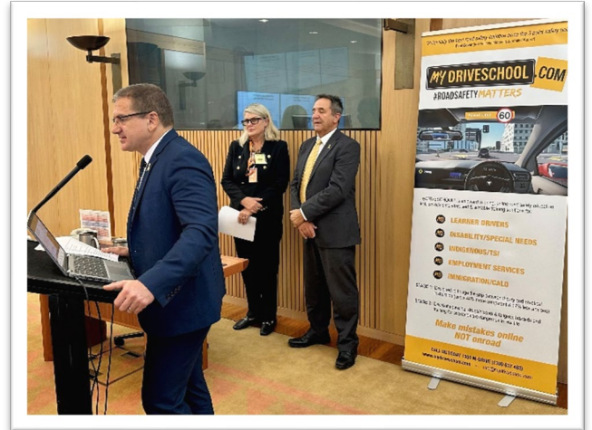
Parliamentary Friends of Road Safety Forum February 2024