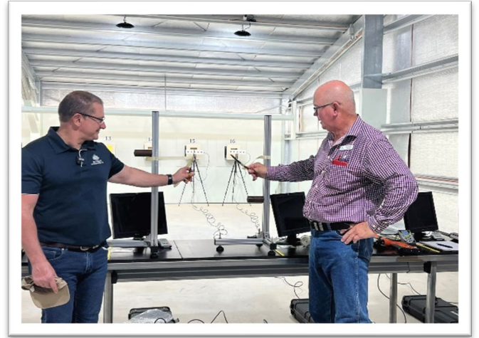
Official opening of the Maryborough Air Rifle Range, January 2024