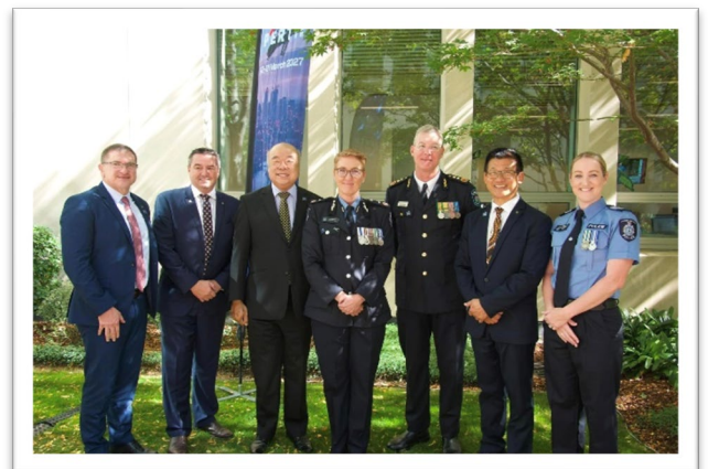
Parliamentary Friends of Law Enforcement and First Responders, March 2024