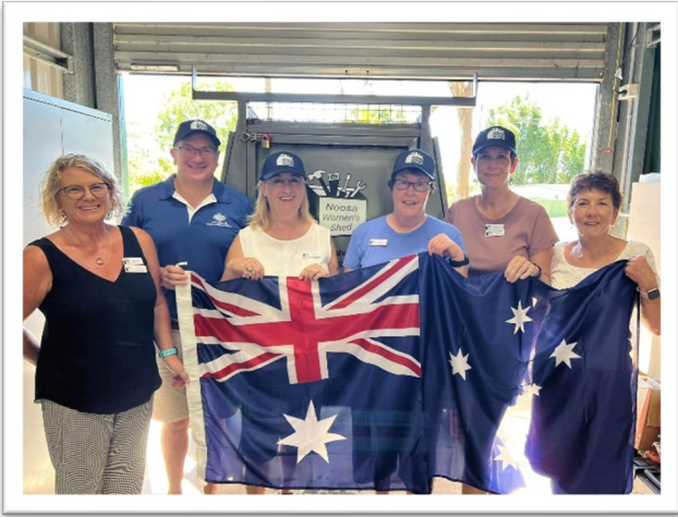
Noosa Women's Shed January 2024