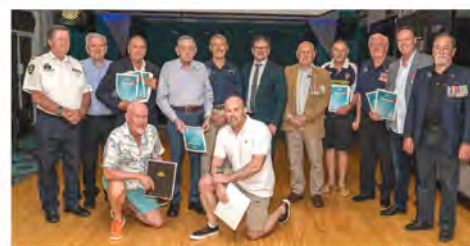
Tewantin Noosa RSL Sub-Branch

Australia owes a great debt to our Veterans and in the lead up to Anzac Day 2023 I had the honour of meeting some of our local Veterans to present them with Certificates of Appreciation and thank them for their service.