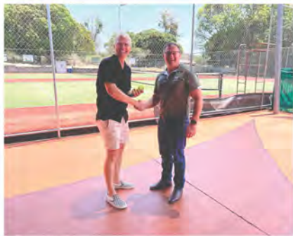
Kandanga Tennis Club

A range of community, sporting, and service groups received funding from Round 8 of the Stronger Communities Program to purchase equipment or undertake small capital projects that help strengthen the community.