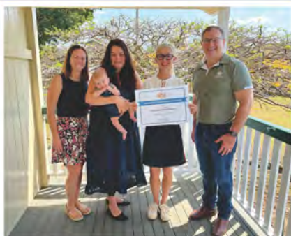
Kin Kin Community House