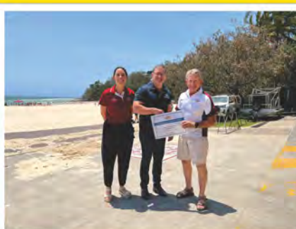
Noosa Heads Surf Lifesaving Club