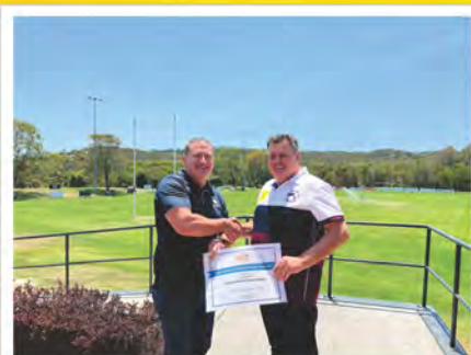
Noosa Rugby Union