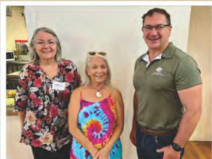
Rainbow Beach Community Info & Resource Assoc.