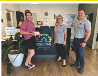
Graham House Community Centre Murgon