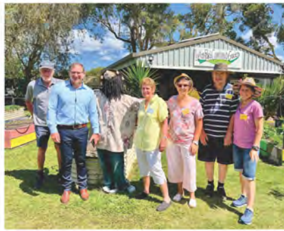
Lupton Park Community Garden Maryborough