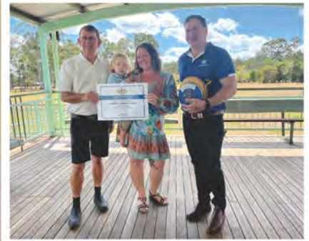
Glenwood Community Centre