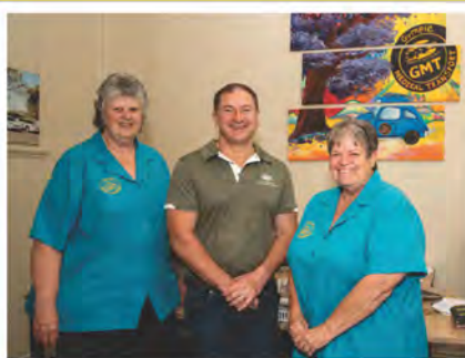
Gympie Medical Transport