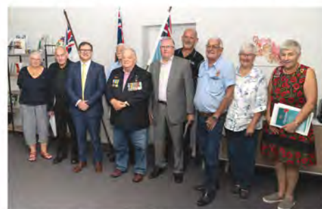
Gympie RSL Sub-Branch