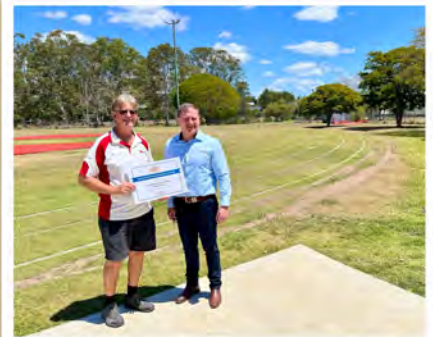
Maryborough Amateur Athletics

$150,000 was shared between eligible groups for a variety of projects across the Wide Bay electorate.