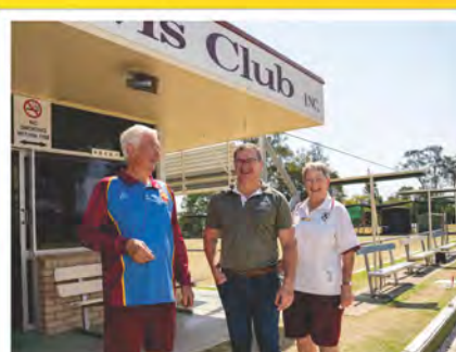
Albert Bowls Club Gympie