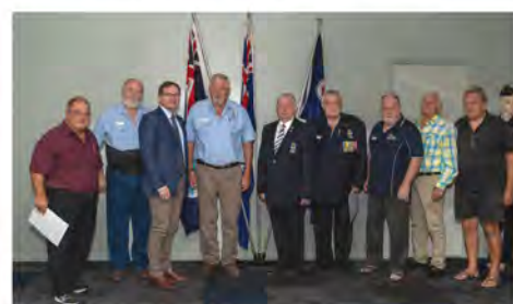
Murgon RSL Sub-Branch