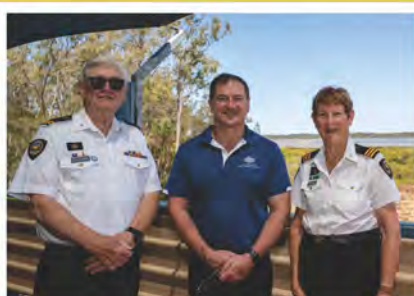
Boonooroo Coast Guard