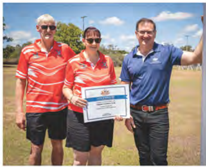
Tinana Football Club