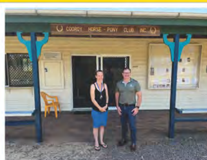
Gooroy Horse & Pony Club