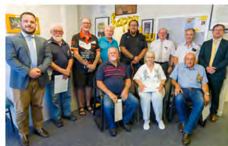
Maryborough RSL Sub-Branch