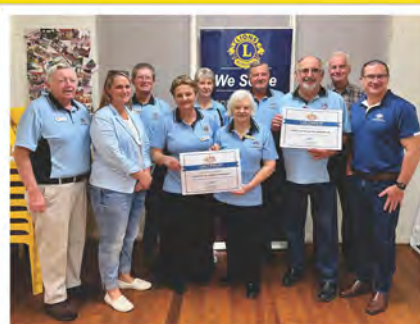
Gooroy Pomona Lions Club