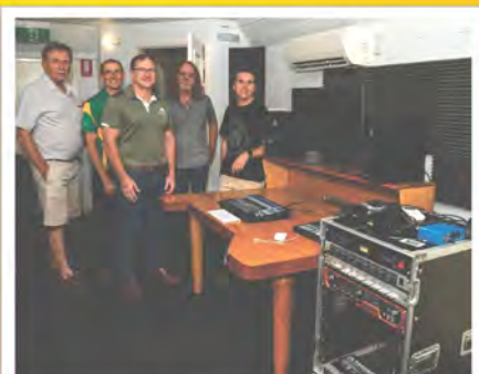
Australian Institute of Country Music Gympie