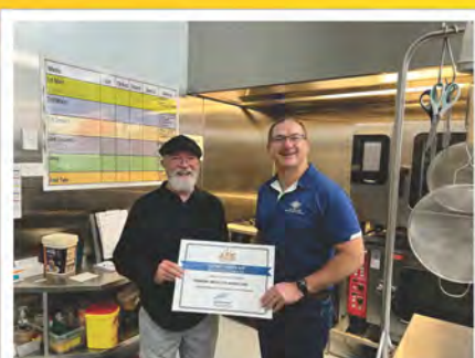
Pomona Meats on Wheels