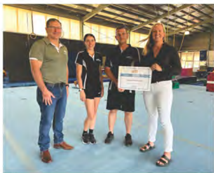
Georoy Gymnastics Club