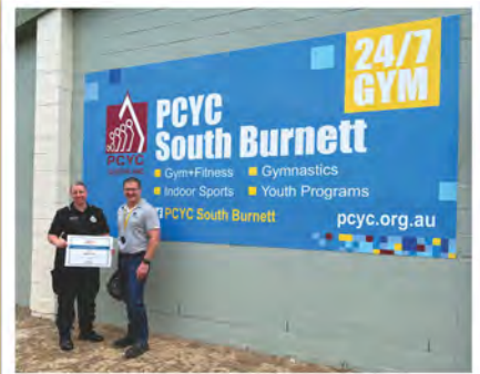
South Burnett PCYC