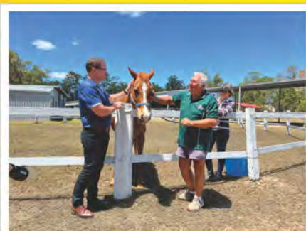
Riding for the Disabled Maryborough