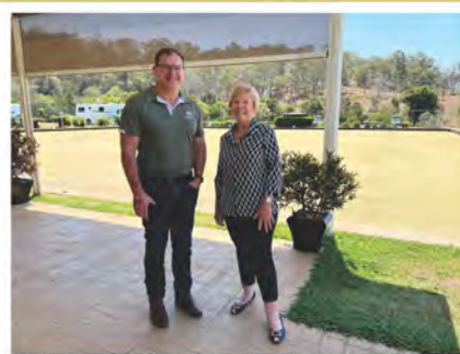
Kandanga Country Club