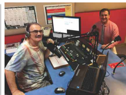
Noosa Community Radio received $5,160 for outdoor broadcasting equipment to keep the community up-to-date on local events.