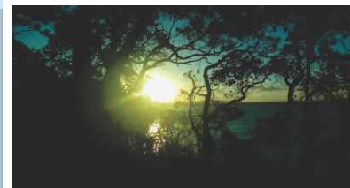
Lan Geromet from Tewantin State School captured the silhouette of trees over the water at Noosa National Park.