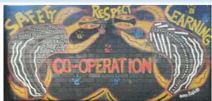
displays values held dear by Australians, shown in a mural at Cherbourg State School.