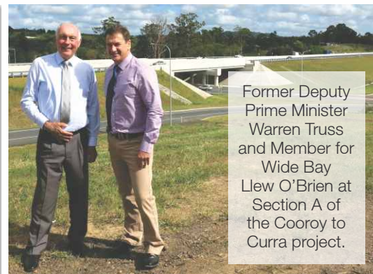
Former Deputy Prime Minister Warren Truss and Member for Wide Bay Llew O'Brien at Section A of the Cooroy to Curra project.

The project involved two new northbound lanes and reconstructing the southbound lanes between the Cooroy southern interchange and Cudgerie Drive, as well as a new four-lane divided highway between Cooroy southern interchange and Sankeys Road at Federal with construction of new bridges over Six Mile Creek.