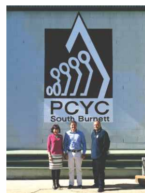
Murgon PCYC installed new acoustic curtains thanks to a $20,000 grant.