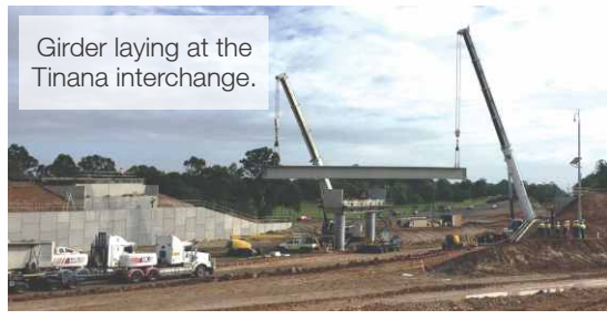
Girder laying at the Tinana interchange.

The Australian Government is providing up to $30.4 million towards the project, with the Queensland Government providing $7.6 million.