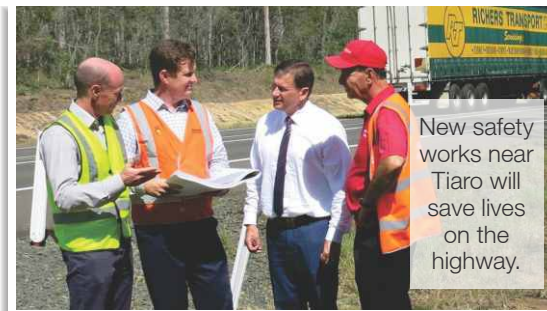
New safety works near Tiaro will save lives on the highway.

Intersections to be upgraded as part of these works include Tahlia Lane, Canterwood Road, Petersen Road, and Hoffman Road.