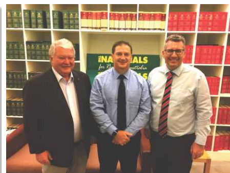
A $20 million jobs package will boost employment in the Wide Bay.